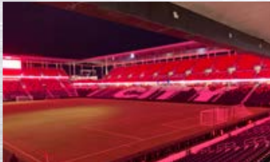
SOLD SLICES AT CITYPARK