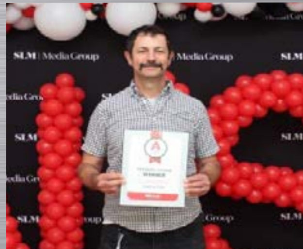
2023 A-LIST WINNER, ST. LOUIS MAGAZINE