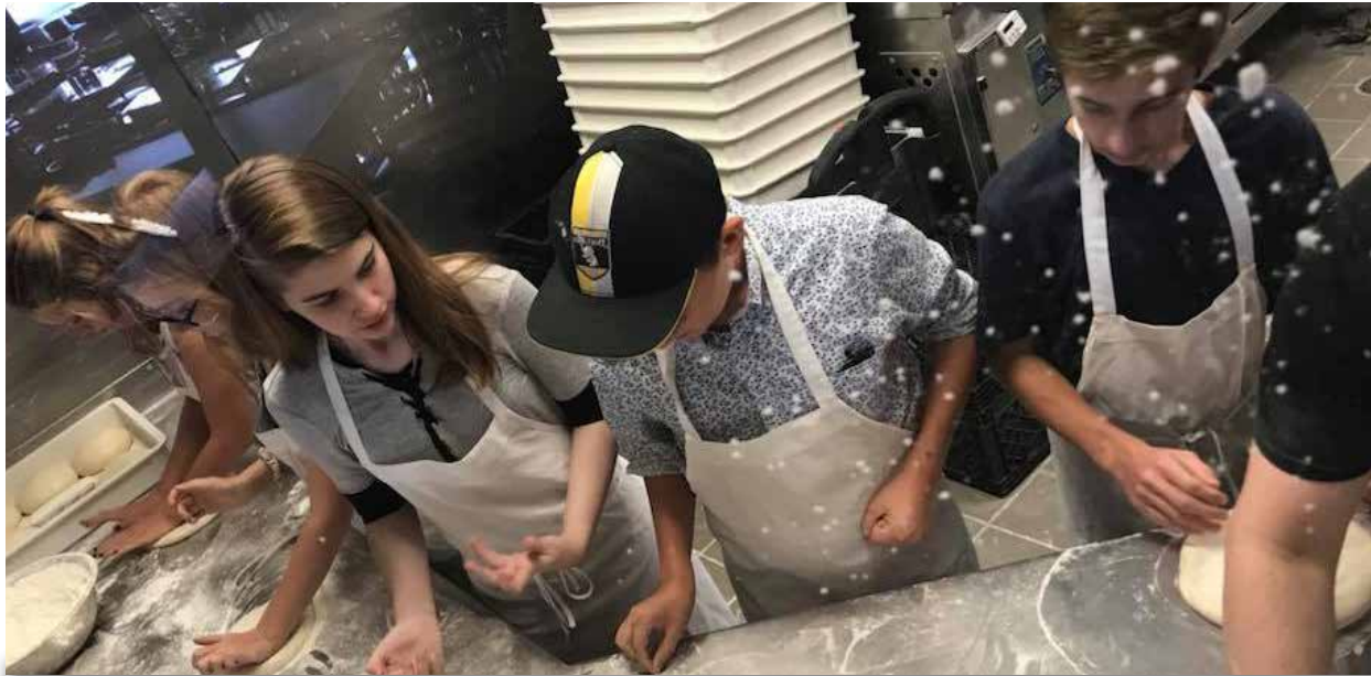
Guests at a Pizza School learning how to work with dough.