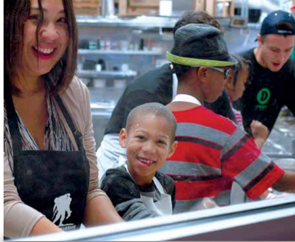
Wounded Warrior Project Pizza School and Warrior Date Night