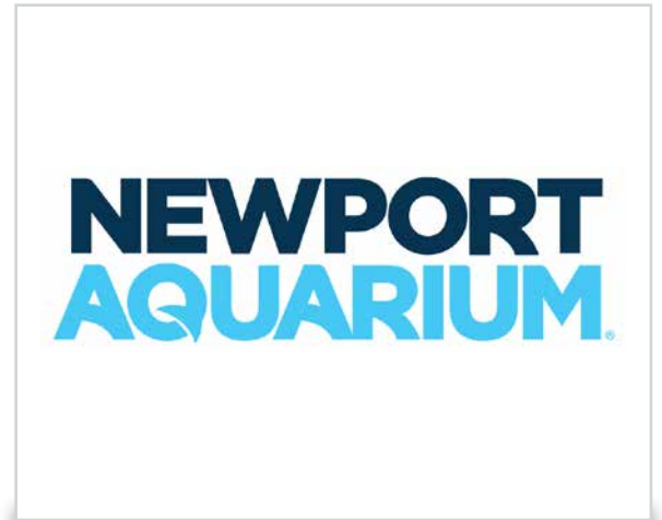
Newport Aquarium Nauti Night