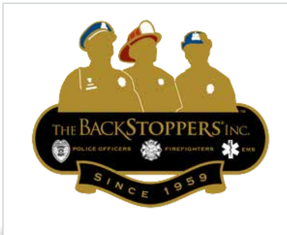
BackStoppers, Inc. DewBrew Project Guns 'N Hoses Event