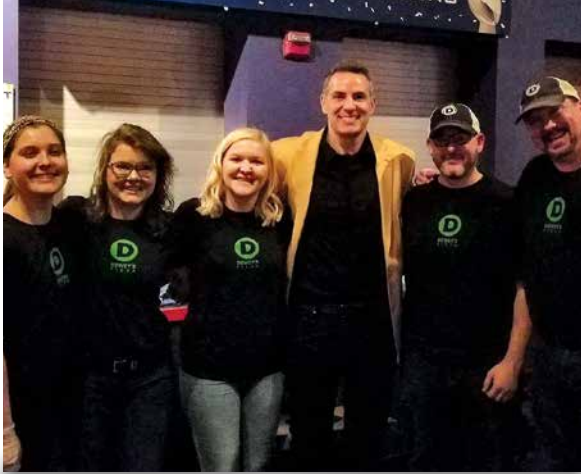
Kurt Warner First Things First Foundation