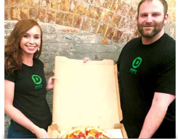
Brackets for Good Kickoff Event