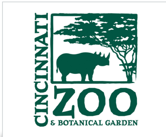
Cincinnati Zoo Wild About Wine